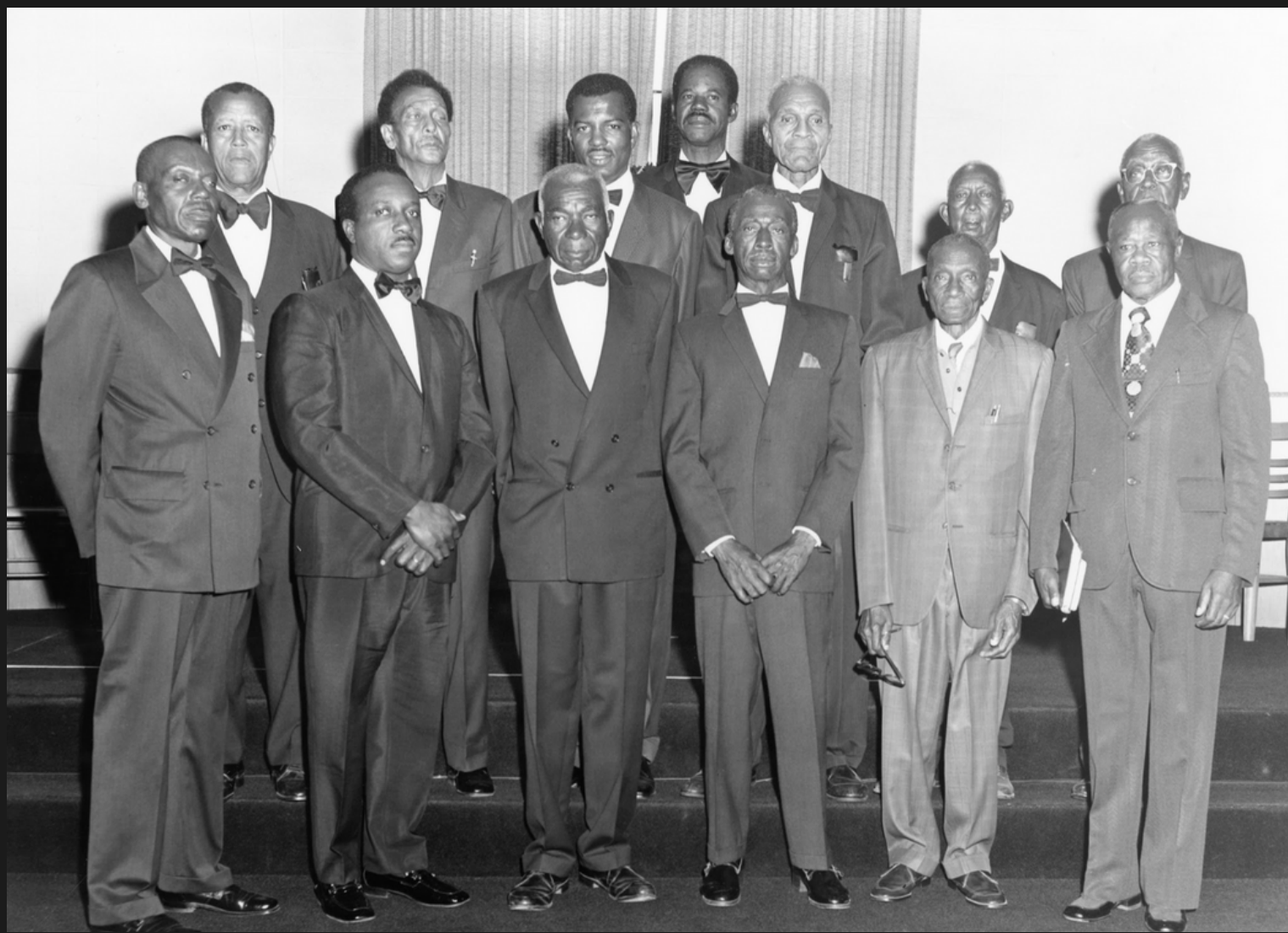
ORGANIZED IN 1911

The 1st predominantly African American Baptist Church in San Bernardino